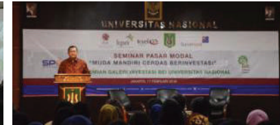
Capital Market Seminar (Faculty of Economics 2016)