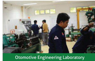
Otomotive Engineering Laboratory