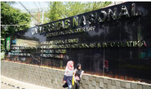
Board of Faculties in UNAS