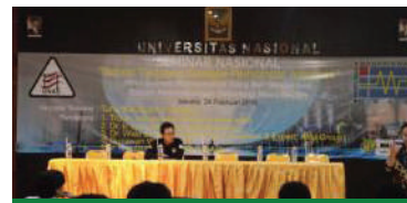
National Seminar "Google Balloon-Powered Internet Access" 2016