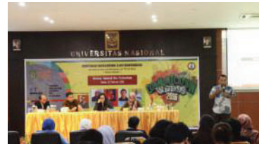
National Seminar of Communication "Communication Weeks 2016"