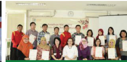
HSK Online Training for Mandarin Teachers (2016)