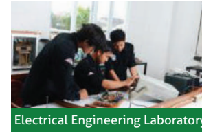
Electrical Engineering Laboratory