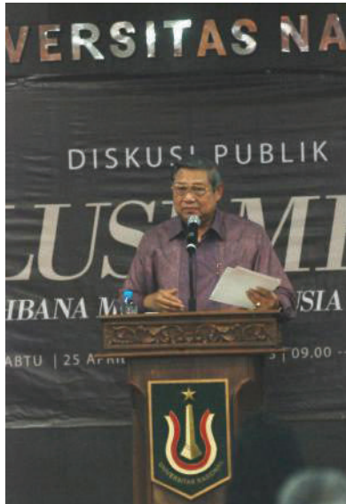
President of RI (2004-2014) Susilo Bambang Yudoyono in Public Discussion on "Mental Revolution of Sutan Takdir Alisjahbana" (2015)