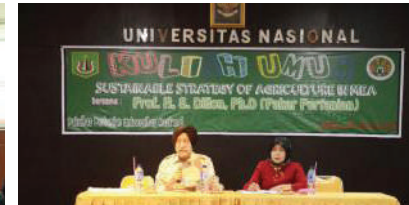
Public Lecture "Sustainable Strategy of Agriculture in MEA" (Faculty of Agriculture 2016)