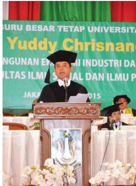
Inauguration of Professorship Prof. Dr. Yuddy Chrisnandi, M.E. (2015)