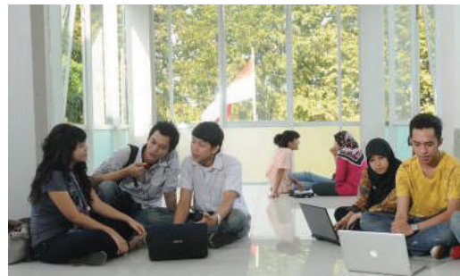
Wifi in UNAS campus