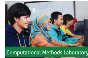
Computational Methods Laboratory