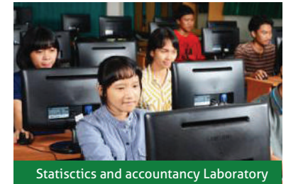
Statistics and accountancy Laboratory