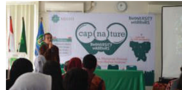
Workshop Capnature Biodiversity Warriors (Faculty of Biology, 2015)