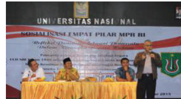
Dissemination of the Four Pillar MPR RI (2015)