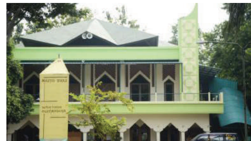
Sutan Takdir Alisjahbana Mosque