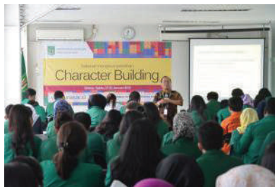
Character Building Training for new students Universitas Nasional (2015)