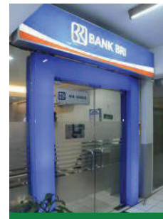
BRI Bank Cash Office UNAS