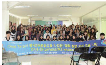
The Dual Target Training in Korean Language and Culture Project Catholic University of Daegu-Universita Nasional (2016)